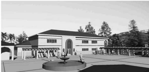
Conceptual Drawing of new Parish Center

Today we take another step in Building on Faith - our historic $5.5 million Capital Campaign that will fund the design, construction and furnishing of a new Parish Center and Hall.